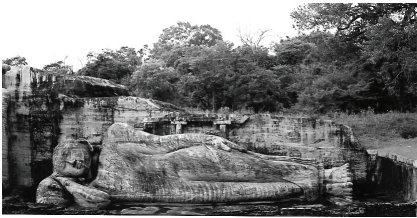
Reclining Buddha, Polonnaruwa, Sri Lanka