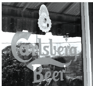
Decal on Front Door of Star Cottage