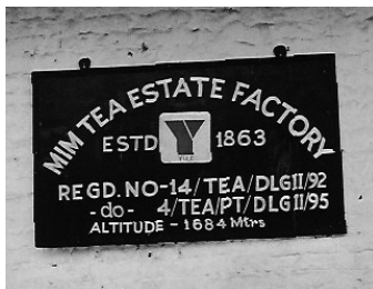
Mim Tea Estate, near Darjeeling