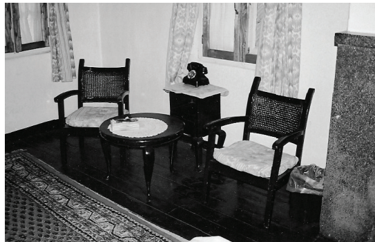
Windamere Hotel, Darjeeling, Room 14, in which Merton stayed