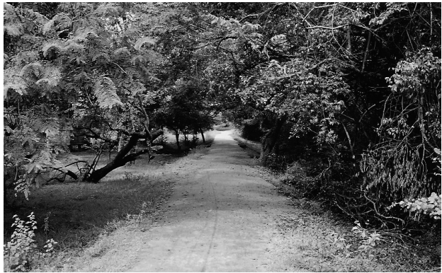
"The path dips down to Gal Vihara"

Kandy was a convenient take-off place from which to visit the great rock of Sigiriya, and from there to reach Polonnaruwa ( AJ 230-36). There I saw the parking lot sign for Gal Vihara, and my heart began to beat a little faster. Where, I wondered, was the path of which Merton speaks, that "dips down to Gal Vihara" ( AJ 233). Ah, there, to the right, and yes, it dips down, yes it does, to Gal Vihara! And so I walked down the very path, and soon came to the place of the great Buddhas. The monastery of which they must once have been the jewel is long gone; but the Buddhas themselves – seated, standing, reclining/dying – remain: serene, majestic, carved out of the living rock which embraces them, unworn by the centuries. For a time I had the privilege of being the only one in their presence, and was able to identify and climb "the sweep of bare rock sloping away on the other side of the hollow" ( AJ 233) on which Merton stood to have a complete view of the statues. Much has been written about Merton's experience here, of how he "pierced through the surface and . . . got beyond the shadow and the disguise" ( AJ 236), and doubtless much remains to be written. My