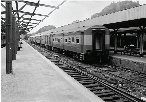
Colombo-Kandy Intercity Express (Merton's "Kandy Express")