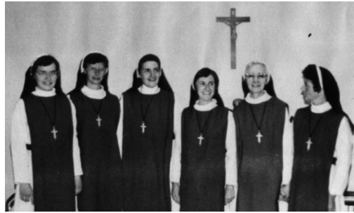
Precious Blood Sisters, circa 1968

left the place shortly thereafter. The nuns in their red and white habit were called Sister Adorers of the Precious Blood, and they had arrived in Eagle River in 1967. The bishop of the diocese had planned on starting a larger retreat center in Anchorage, and the Eagle River setting was meant to be but an interim convent for the contemplative order. The lack of water near the convent forced the nuns to leave the place in 1970 and move to Anchorage. The busy life the bishop placed on them, as contemplatives, nudged many of the nuns to return to their mother house in 1972. The place was sold, and in 1972 the evangelical group Campus Crusade for Christ bought the property and more land in the area. There was a significant number within Campus Crusade in the late 1960s and early 1970s that were questioning their limited and a-historical understanding of Christianity. Many came to see that the form of Christianity they were committed to was thin and missing in much. It was in the 1970s and 1980s that many leaders within Campus Crusade became Orthodox. This tale is well recounted in Becoming Orthodox: A Journey to the Ancient Christian Faith by Peter Gillquist. 4 There was a thriving Campus Crusade group in Anchorage in the 1960s-early 1970s, and it was this group that became Orthodox and bought the property in 1972 where Merton had led the retreat in 1968.