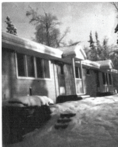
Precious Blood Convent at Eagle River

Sense of belonging here. The spirit of the community is good. They will move to a better site. This is a nice house but has "a water problem" ( TMA 11).