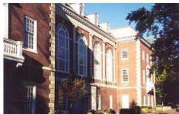
King Library University of Kentucky

A visit to Merton’s libraries provides an interesting look back to the time before the computer age took us into cyberspace for much of our research. In Merton’s time, books were a major source of information and he documented that fact. We are grateful that Merton left us with a record of the path he chose to collect the data he needed to support his literary work.