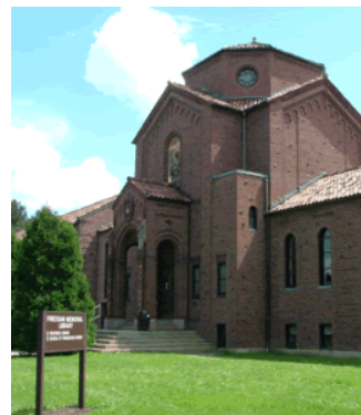
Friedsam Memorial Library St. Bonaventure University

While teaching English at St. Bonaventure, he lived with both