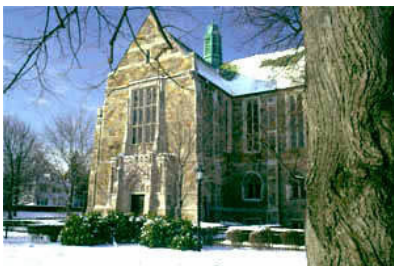
Bapst Library Boston College