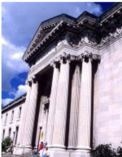
Louisville Public Library

Through the remaining years of his life, Merton continually referenced books and magazines from various libraries that he found profitable to his work. (See Appendix for a listing.) Looking at