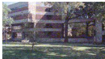
Ekstrom Library University of Louisville