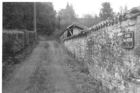
Chemin Thomas Merton, Saint-Antonin.

Meanwhile, in the early days of March 1930, Saint-Antonin, in common with many other parts of the region, had been swept by devastating floods. Widespread, long-term deforestation had left the region vulnerable to exceptional meteorological events, such as those that now combined in a dramatic way. Heavy rain, along with a rise in temperatures which suddenly melted the winter's snow, saw the river Tarn peak in Montauban on 3 March at 11.49 meters above normal. 24 In Saint-Antonin the Aveyron and the Bonnette combined their forces to flood 100 hectares, destroy nineteen houses, leave