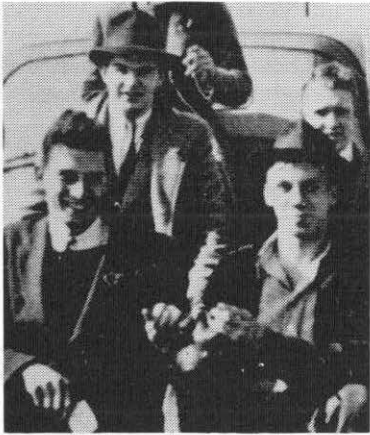
MERTON & COLUMBIA CHUMS Ca. 1936