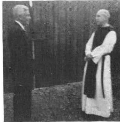
MARK VAN DOREN & MERTON Gethsemani, September 1957