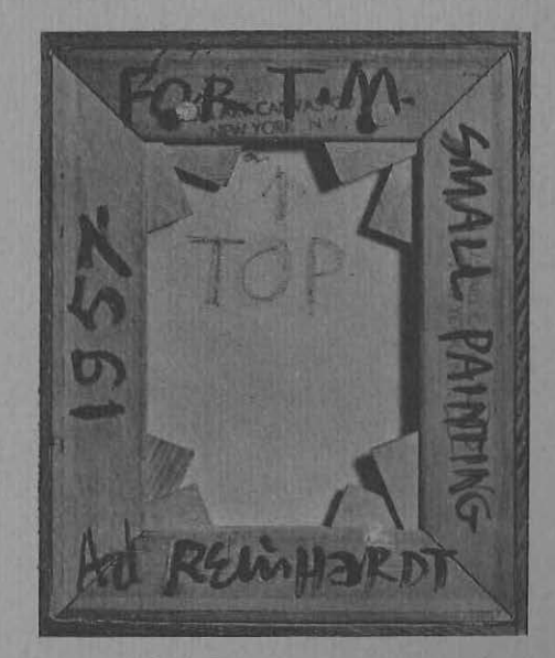
Reverse of Black Cross Painting, by Ad Reinhardt Lettering by Ad Reinhardt